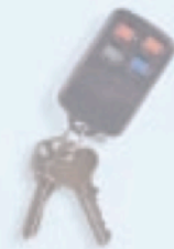
Smart-Key Wireless Remote